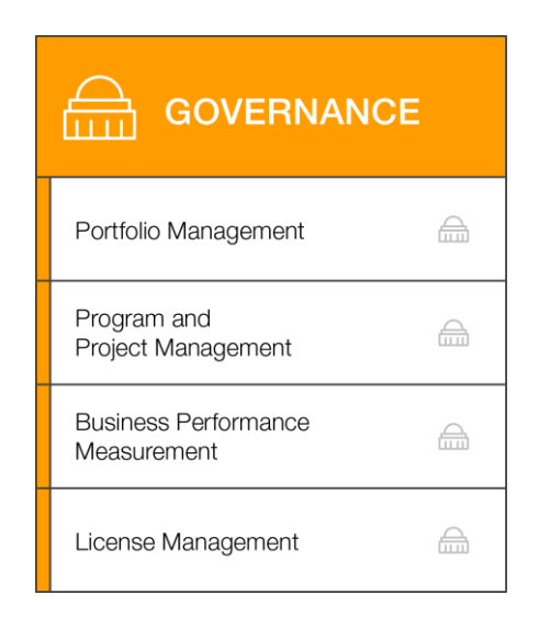
Figure 4: AWS CAF Governance Perspective Capabilities

This Perspective includes Program Management and Project Management capabilities that support governance processes for cloud adoption and ongoing operations. Figure 4 illustrates the AWS CAF Governance Perspective Capabilities.