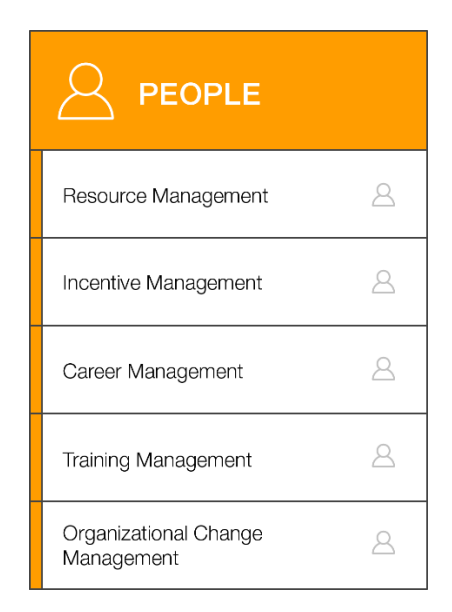
Figure 3: AWS CAF People Perspective Capabilities

The People Perspective supports development of an organization-wide change management strategy for successful cloud adoption. Figure 3 illustrates the AWS CAF People Perspective Capabilities.