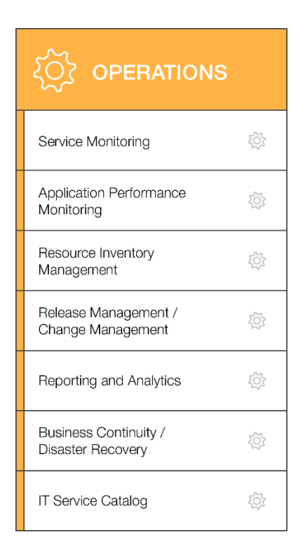
Figure 7: AWS CAF Operations Perspective Capabilities